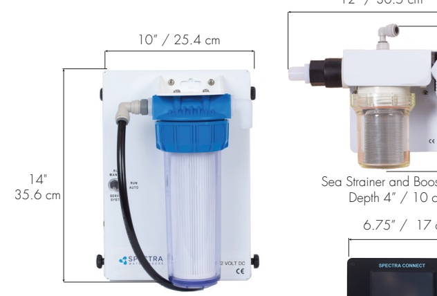
Feed Pump Module Depth 4.5'' / 11.4 cm